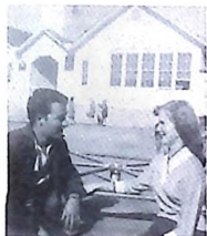
Best Companion On A Desert Island Prettiest Hair