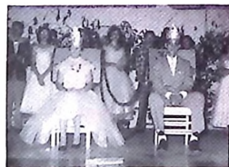
Carnival King and Queen