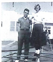
Best Personality Neatest