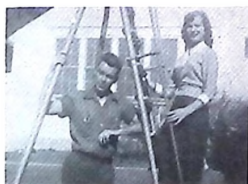
Best Figure and Physique Best All Around Most Handsome and Prettiest Prettiest Smile Most Popular