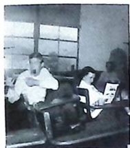
Why Teachers Go Mad