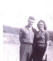
Most Likely To Succeed